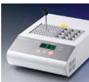
Double block digital dry bath heater