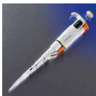
Corning Lambda Plus single-channel pipettor