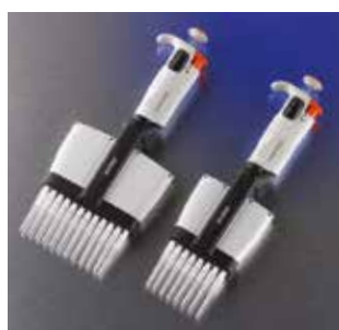
Corning Lambda Plus 8-channel and 12-channel pipettor