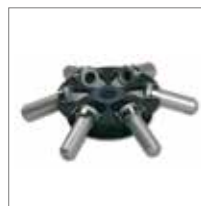
6 x 5 mL swing-out rotor (Cat. No. 480138)