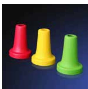
Extra nose pieces