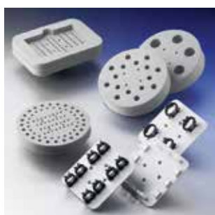
Accessory heads for Corning LSE vortex mixer