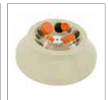
Combination rotor (Cat. No. 480143)