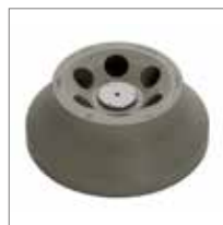
6 x 50 mL fixed angle rotor (Cat. No. 480136)