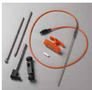
Digital hot plate accessories

When used with the digital hot plate or stirring hot plate, the external temperature controller ensures precision temperature accuracy of the liquid inside the vessel as opposed to the temperature of the hot plate top.