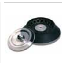
18 x 1.5 mL fixed angle rotor (Cat. No. 480139)