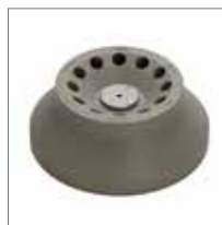
12 x 15 mL fixed angle rotor (Cat. No. 480137)