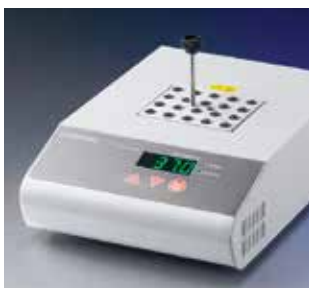
Single block digital dry bath heater