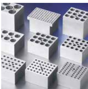
Digital dry bath heater accessories