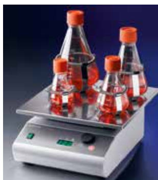
Orbital shaker with optional clamps and flasks