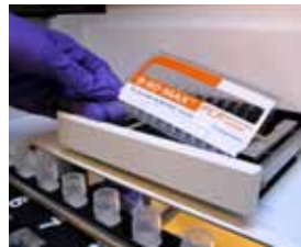
Microfluidic PCR cartridge