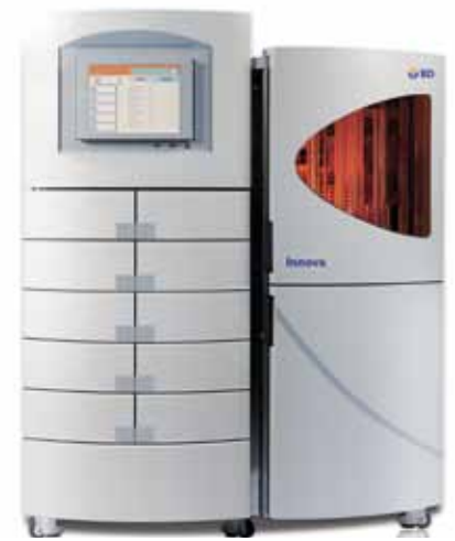
BD Innova™ Platestreaker

The Innova™ is ideal for a high volume laboratory due to its large capacity and long walk-away time but also suitable for small to medium volume laboratories due to its versatility in processing a wide variety of specimen types and specimen containers at once with minimal intervention required.