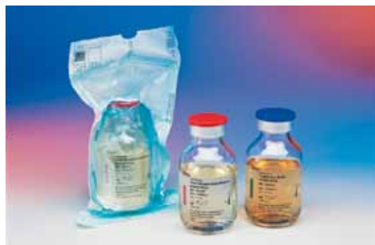
Fluid Thioglycollate Medium, Sterile Pack Double-Wrap, and Tryptic Soy Broth, Sterile Pack Double-Wrap

BD Prepared Bottled Media are offered in a wide variety of bottle styles and fill volumes designed to meet customers' requirements: