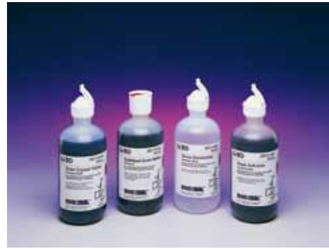
The 4-Step Gram Stain Kit, available with stabilized/unstabilized iodine.

Available with Stabilized/Unstabilized Iodine.