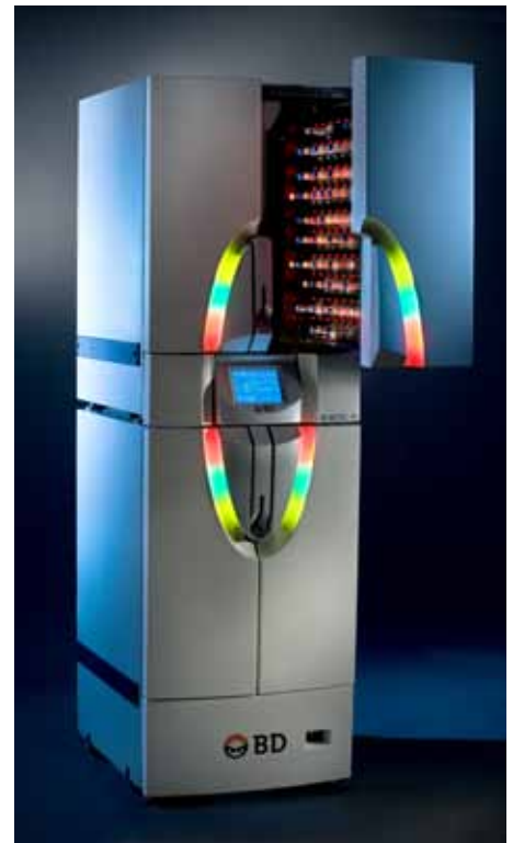
BD BACTEC FX™ Instrument Stack consisting of 1 top and 1 bottom unit

The BACTEC FX™ instrument supplied with the BD EpiCenter™ Information Management System provides a unique solution to effectively track and communicate critical information throughout your manufacturing process