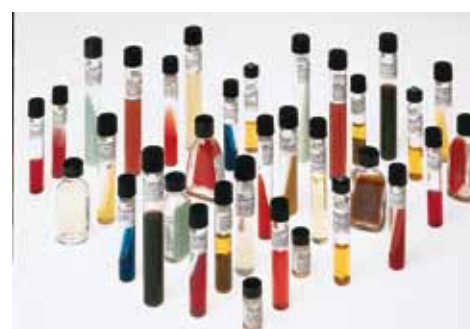
BD offers a wide variety of BBL™ Prepared Tubed Media for the isolation and identification of microorganisms.

On receipt, store according to label directions. Media containing dyes must be protected from light at all times. In some tubes, agar and semi-solid agar (including thioglycollate-containing media) may become distorted within the tube during shipment. These can be restored to their proper condition by loosening the cap, bringing to 100°C in a