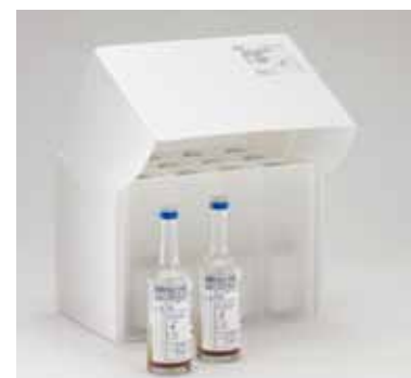
BD BACTEC FX™ media bottles in EtO gassed, double wrapped, plastic box.