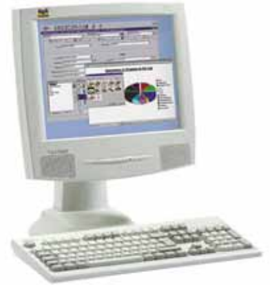
BD EpiCenter™ Data Management System

... resulting in enhanced data handling and trend analysis. Graphics and tables can be displayed by simply pushing a button.