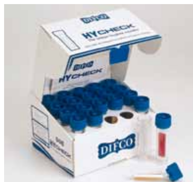
Difco™ Hycheck™ for Enterobacteriaceae,

Hygiene contact slides used to assess the microbiological contamination of surfaces or fluids. Double sided. Feature a hinged paddle that bends for easy sampling.