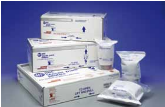
BBL™ Sterile Pack Plated Media products feature unique packaging that minimizes the risk of false contamination both going into and coming out of your critical environment.