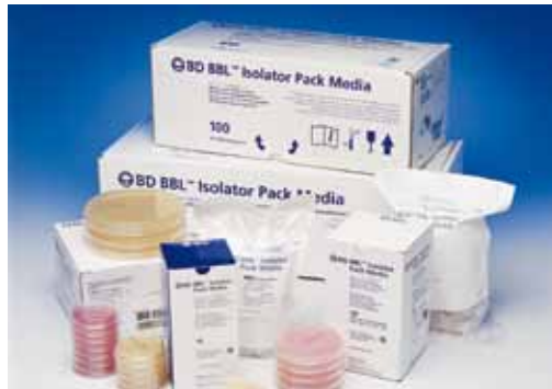
Plated media in gamma-irradiated packs for isolator systems—multi-wrap packaging protects media from vaporized hydrogen peroxide exposure.

Media include D/E Neutralizing Agar, Sabouraud Dextrose Agar with Lecithin and Polysorbate 80 and Trypticase Soy Agar with or without Lecithin and Polysorbate 80. Available plate types including RODAC™ (Replicate Organism Detection and Counting) for personnel and surface sampling and Finger Dab™ for sampling of gloved hands. Storage temperature: 2 to 8°C.