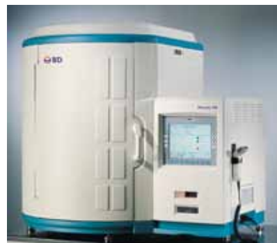
The BD Phoenix™ 100 instrument is easy-to-use and can perform up to 100 tests simultaneously.

The BD Phoenix™ Automated Microbiology System combines world class automation with state-of-the-art microbiology to deliver rapid, accurate identification of clinically relevant bacteria. Phoenix™ panels are currently available for identification of gram-positive and gram-negative bacteria. Phoenix™ panels are stored at room temperature and have a one-year shelf life.