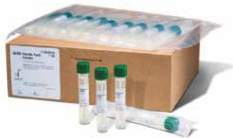
BD Sterile Pack Swabs for Environmental Monitoring,

BD Sterile Pack Swabs are the first, double-wrapped, gamma irradiated, ready-to-use sterile swabs for surface sampling, combined with a rinse solution-filled tube.